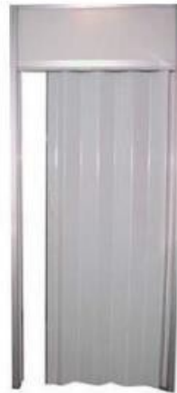
C21B – Ply Door $140