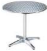
C8A – Aluminum Round Table Low $85