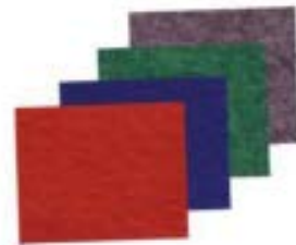
C24 – Carpet per M 2 $25