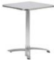
C8B – Aluminum Square Table $90