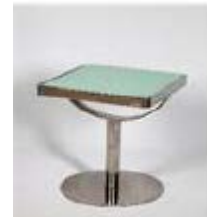
C8F – Side Table $80