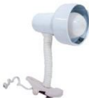
C16E – 1 Bulb Clip-on Lamp $40