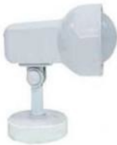
C16C – 1 Bulb Lamp $30