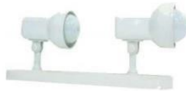
C16B – 2 Bulb Lamp