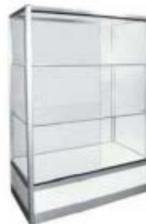
C12B – Showcase $375