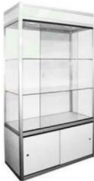
C12 – Showcase $375