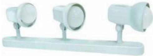
C16A – 3 Bulb Lamp $60