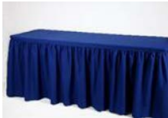
TBL 002 Table with Cloth $150