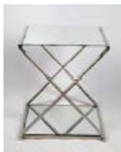
C8C – Cross Side Table $125