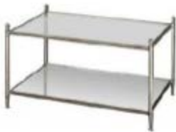
C19 – Center table $180