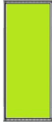
C15 – Colored Panel $170