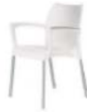
C6B – Aluminum & Plastic Chair $70