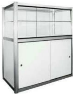
C11B – Counter with Glass Display $350