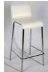
C6D – Cocktail Chair (high) $80