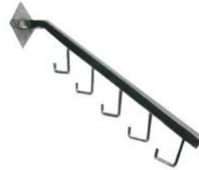
C23B – Hanger (Cascading) $60

* Each wall fits 3 shelves. If you order #C9 please specify the exact heights and location of every shelf ordered. If not, the shelf will be installed at the standard location (1.5 meters from the ground).