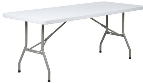
TBL 001 Rectangular Table 30" x 72" $125