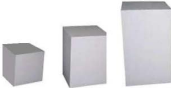
C1 – Cube $70