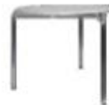
C8E – Round Aluminum & Plastic Table Low $85