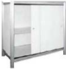
C10 – Counter $280