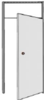
C21 – Door with Lock $150