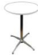
C8D – High Aluminum & Plastic Table $90