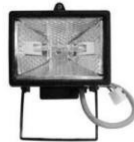
C16D – Halogen Lamp $90