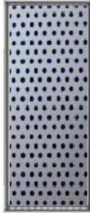
C14B – Perforated Panel $80