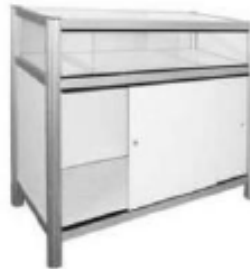
C11 - Counter with Glass Display $300