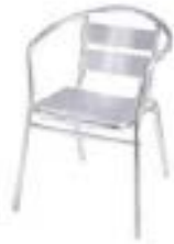
C6A – Aluminum Chair $60